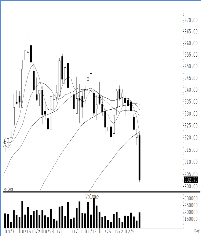
S50Z24 (Close 902.70 Chg -18.50)